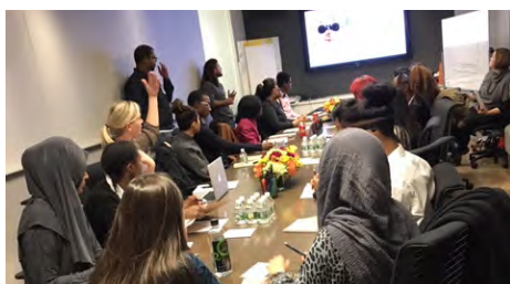
JuicePharma workshop with youth in The Emergence Project SM