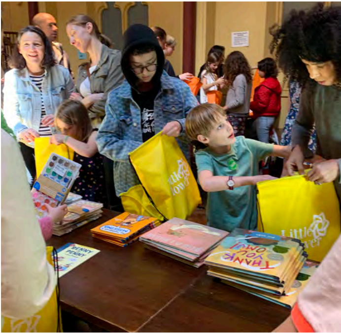
Students and families of Packer Collegiate Institute assembling goody bags for Little Flower youth