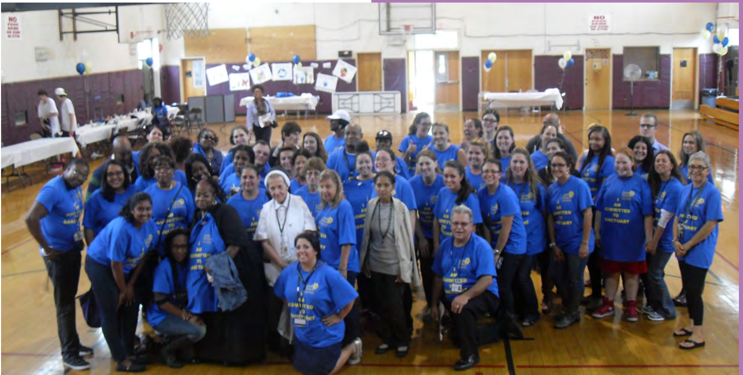
Sanctuary Kick Off Event

With the model, we aim to provide the best care for our clients' well-being and a positive work environment for our staff while maintaining a trauma-informed culture that makes it easier to identify stress in our community. Being attentive to these indicators enables us to create a safe and nurturing atmosphere for everyone to flourish.