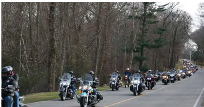
Long Island Harley Owners Group arriving on the Msgr. John T. Fagan campus for the Annual LI HOG's Toy Run