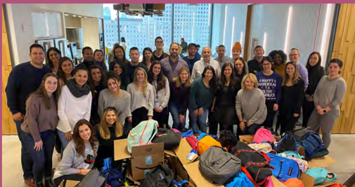
MediaCom Holiday Backpack Donation Event