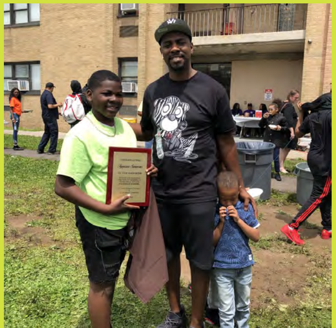
St. John's resident with his family at the 2019 Annual St. John's Day