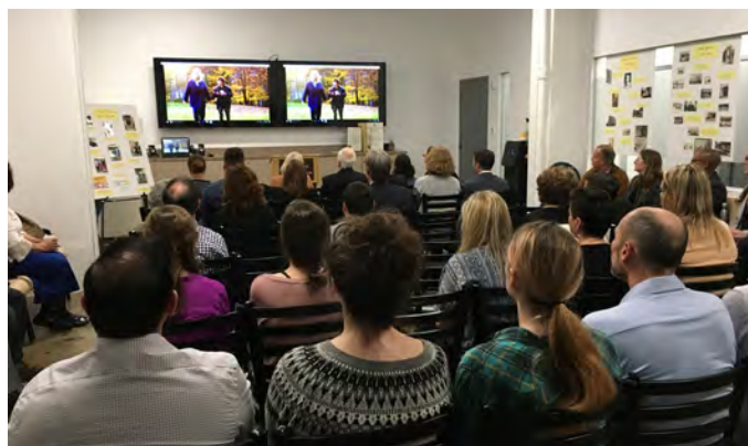
Guests watching the Little Flower video during the Grand Opening