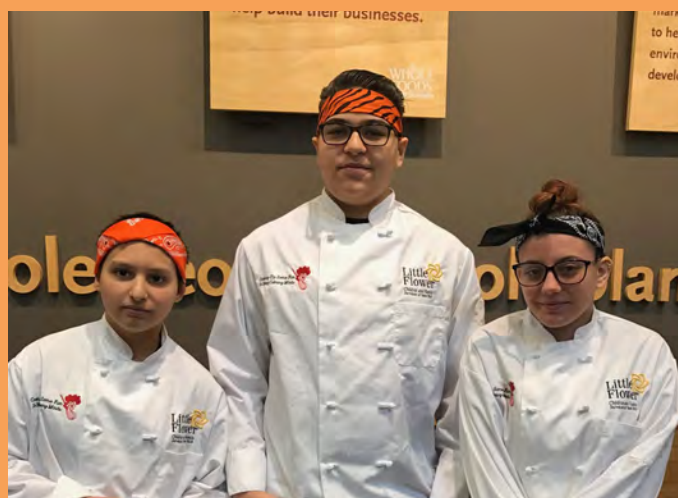
Youth in the Culinary Arts program, in the Residential Treatment Center (RTC), competing in the Junior Iron Chef competition.