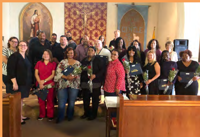
Staff milestones recognized at the 90th Anniversary celebration

Through change we remain true to the children, families, and adults in our care. We look to the future with great hope to further our mission of transforming caring into action to ensure the well-being of those we serve so that they can reach their full potential.