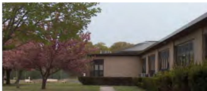
The Little Flower Union Free School District is located on the Msgr. Fagan campus