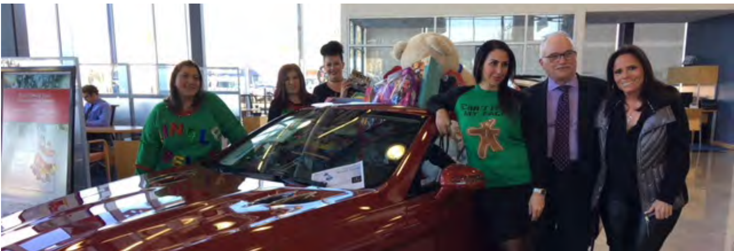
Mercedes-Benz of Smithtown Fill a Car Holiday Donation